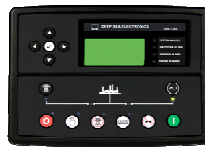
DSE-7320 Remote Control Panel